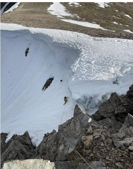
Photo: Dog being rescued from Grays and Torreys

In alpine environments, there are often steep and rocky terrains, as well as potential hazards such as cliffs and crevices. A leash provides control over the dog, reducing the risk of accidents or injuries.