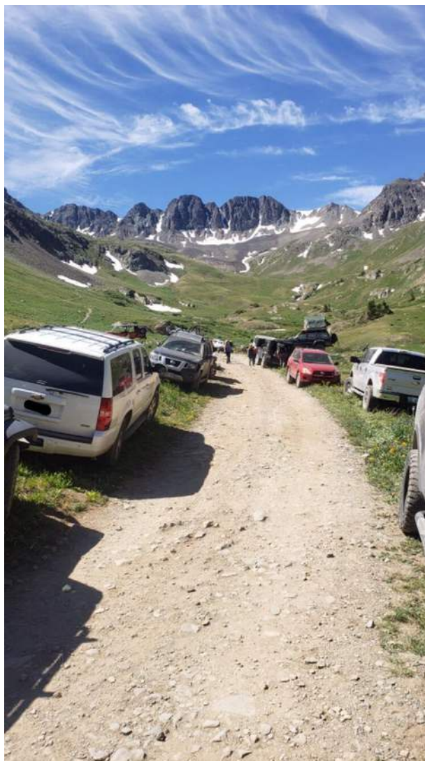
Photo: Cars parked on fragile alpine tundra

If there is no trail, travel on durable surfaces such as rock or snow. Camp below treeline in existing campsites, 200 feet from trails and water sources (70 adult steps). Walking around muddy areas encourages trail braiding which leads to erosion and more damage. Watch where you park your car.